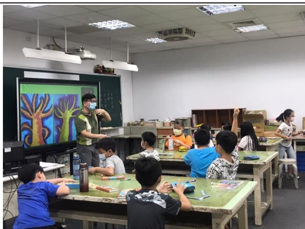
Teaching how to draw a tree through presenting the works.