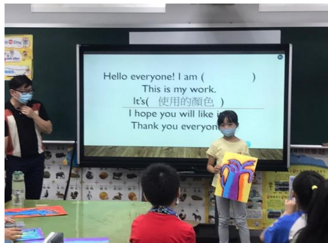
Students present their works in English.