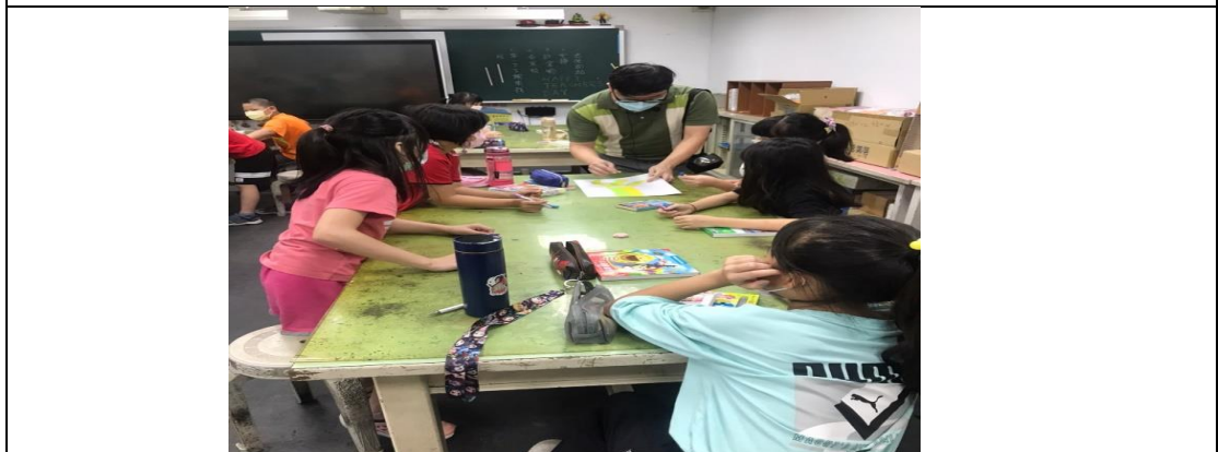
Teacher goes to every group to demonstrate how to paint the tree.