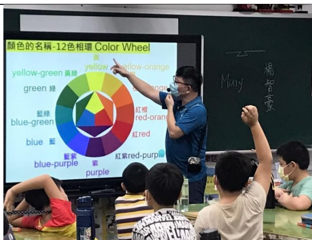
Introducing 12 color wheel as review of colors.