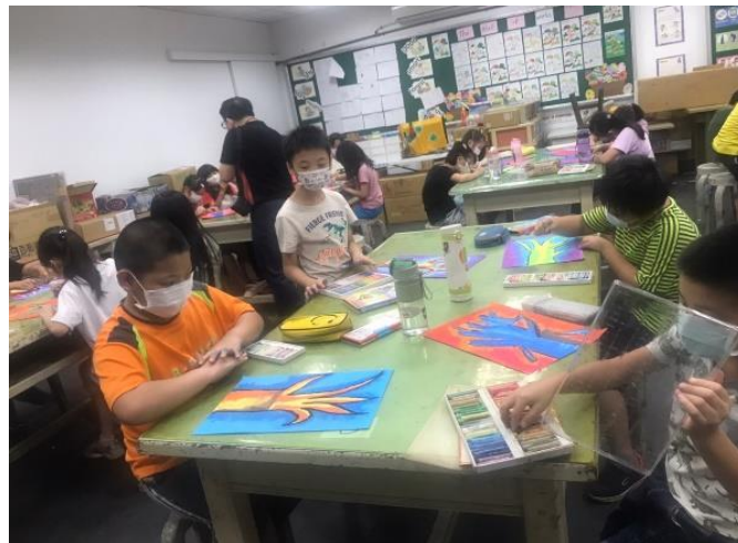
Students are working hard.