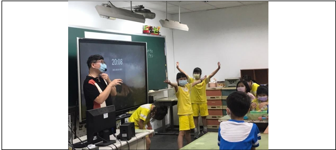
Students imagine they are a tree.