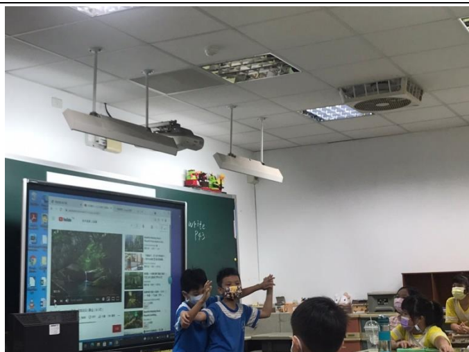
Students work in pairs to form a tree through body language.