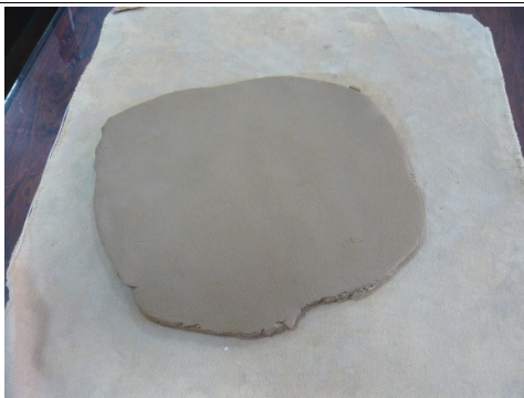
Flat clay 壓平土片