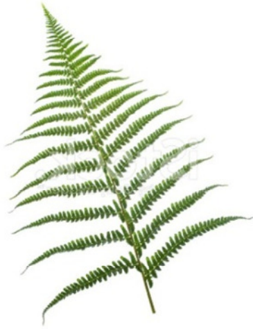
Fern leaf 蕨葉