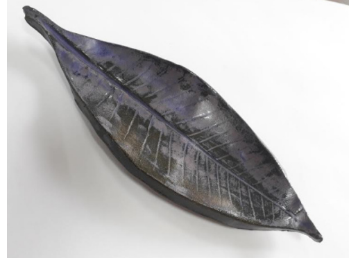
After firing 釉燒後之成品