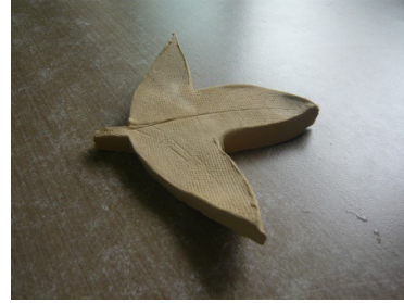
Clay hardens 陶土硬化