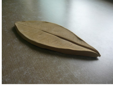
After a day 一天後