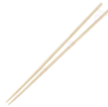
Long bangboo stick