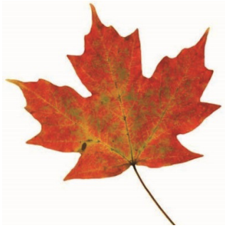
Maple leaf 楓葉