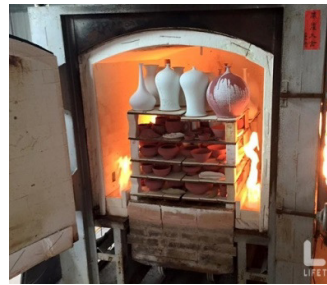
Kiln fired 窯燒