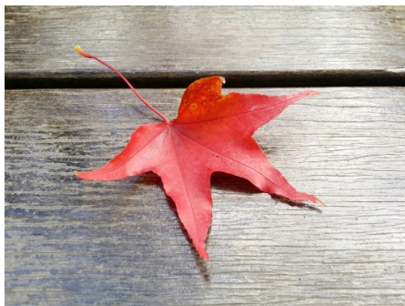
Maple leaf 楓葉