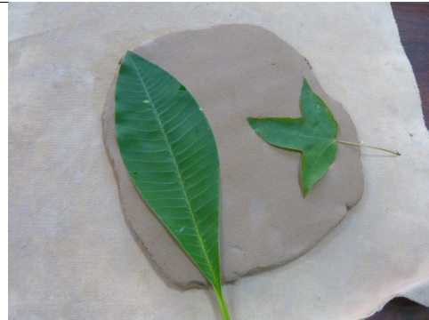
Leaf mold 葉子壓模