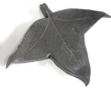
After kiln fired to 1200 degrees 燒至 1200 度過後