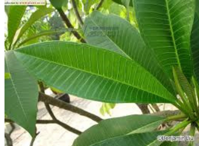
Frangipani leaf 雞蛋花葉